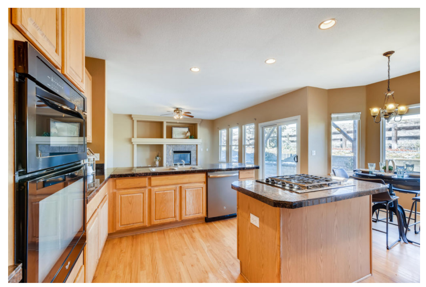
Gas Stove, right off Family Room, great for entertaining