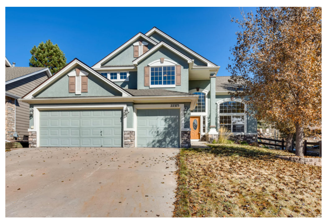
Beautiful exterior with 3 car garage

Must see 2 story gem in Canterberry Crossing!