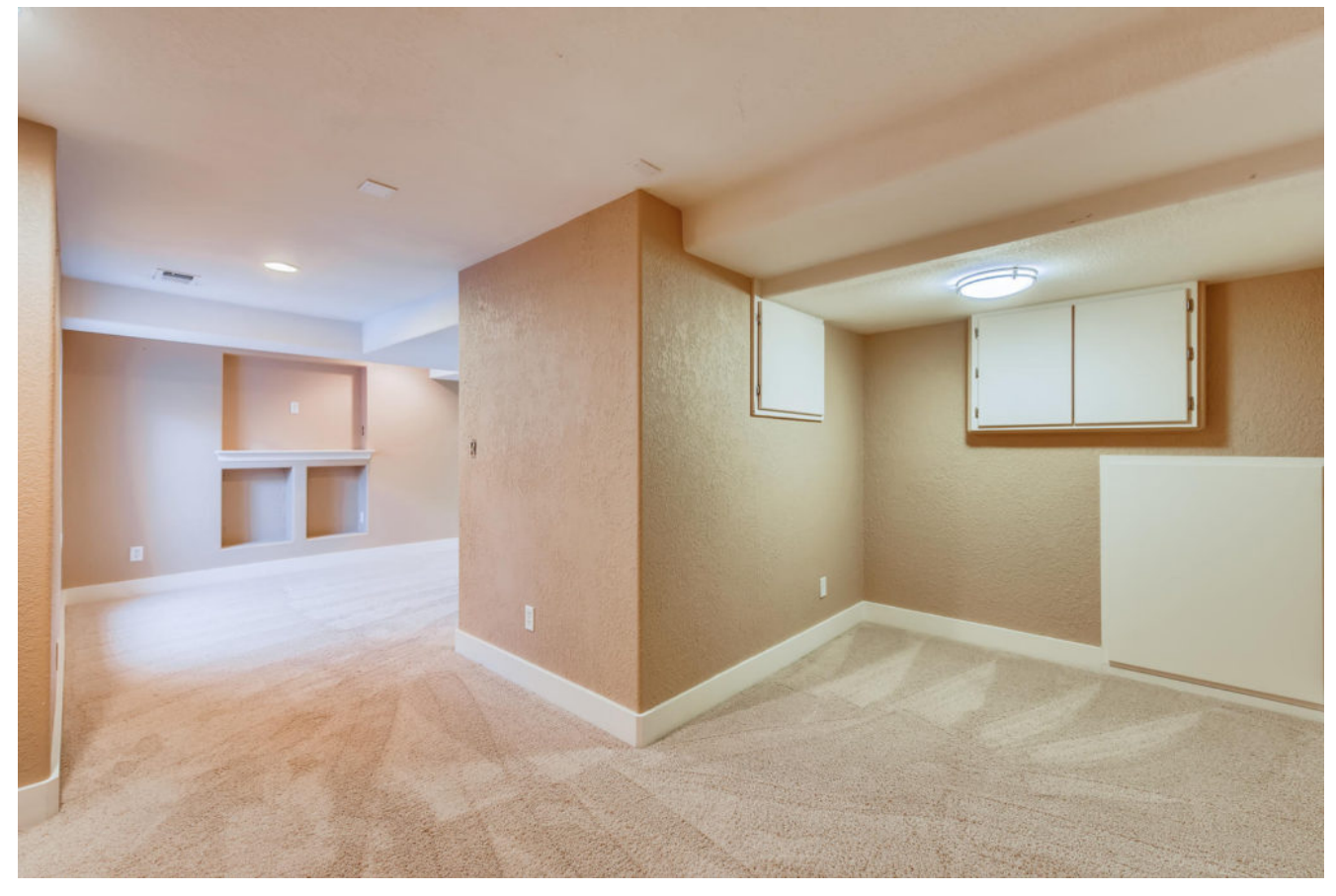
Beautifully finished basement