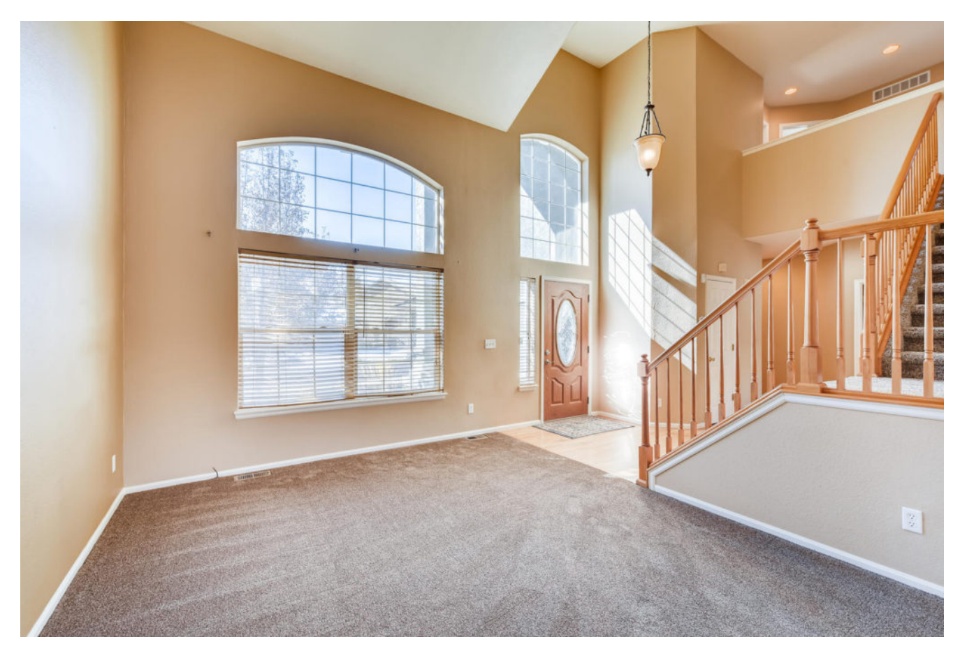
Tons of natural light in this home