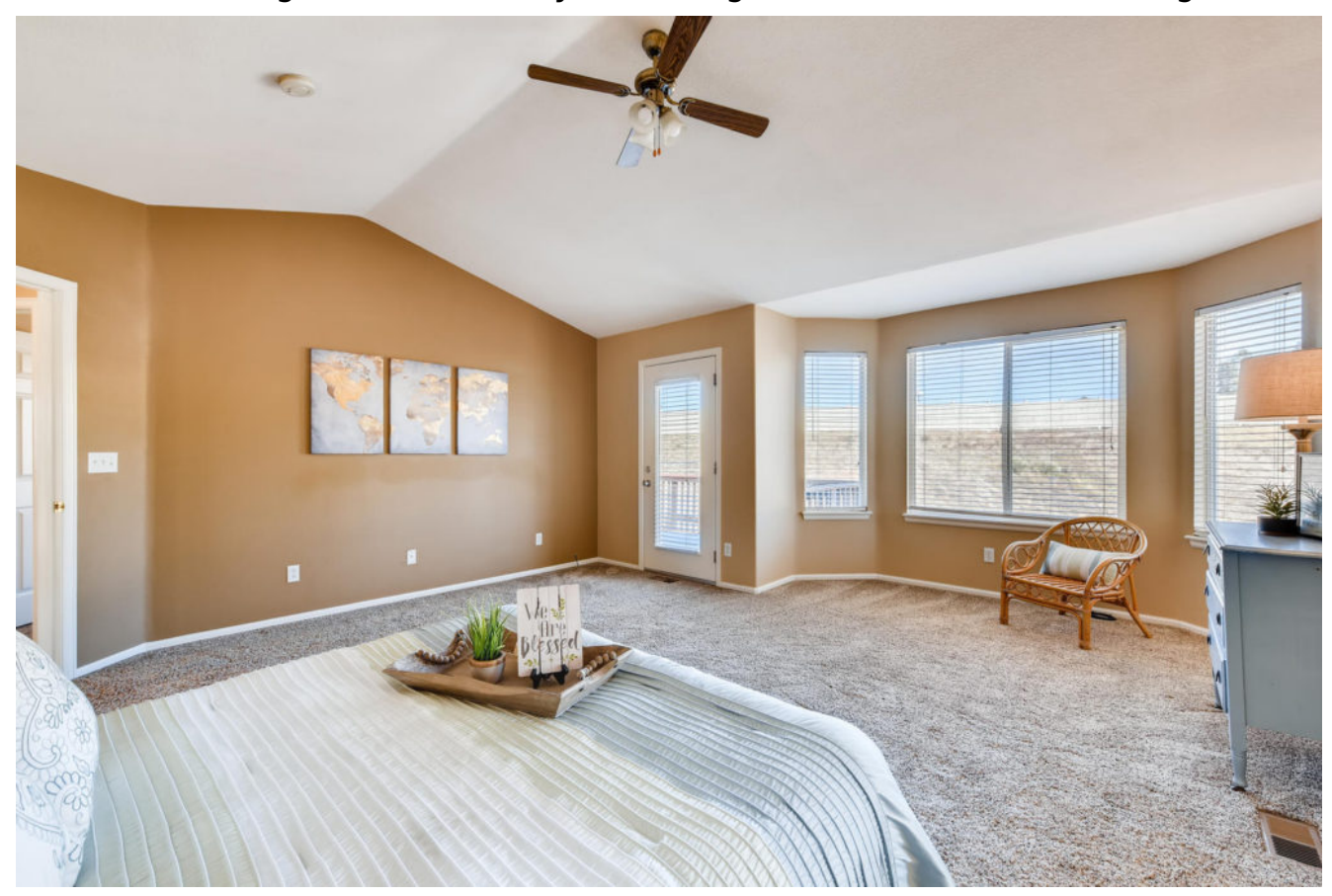
Huge Master Suite with 5 piece master bath and a deck