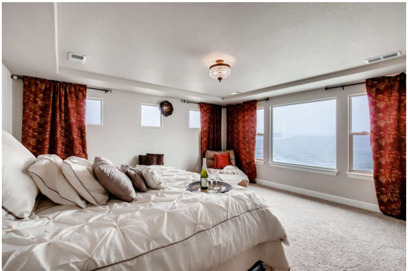
This home is perfect for multi-generational living as it has a fully finished walk-out basement.