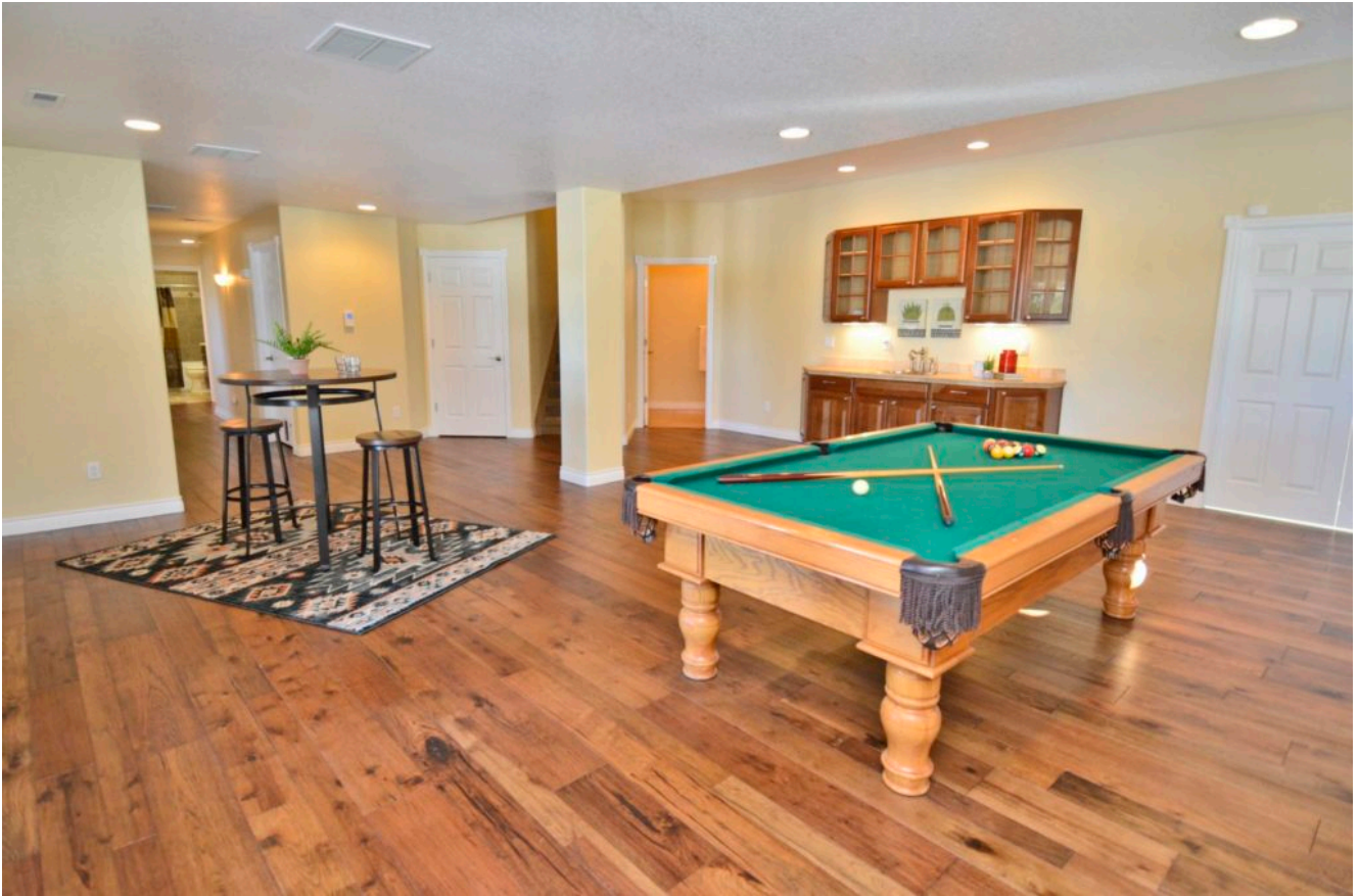
Finished Basement with plenty of room to entertain