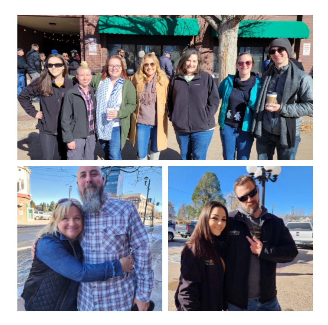
YOU get a PIE. and YOU get a PIE. And EVERYONE gets a PIE!