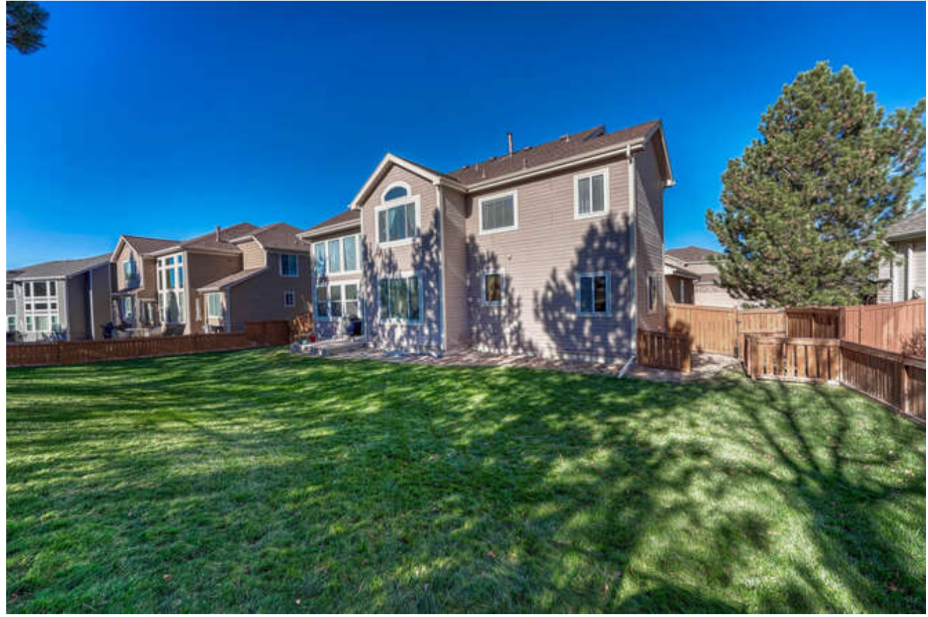
Adjacent to <a href="Plum Creek Golf Course">Plum Creek Golf Course</a>.

Contact top Castle Rock, Colorado / Douglas County Realtor